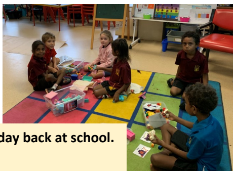
Happy faces for the first day back at school.