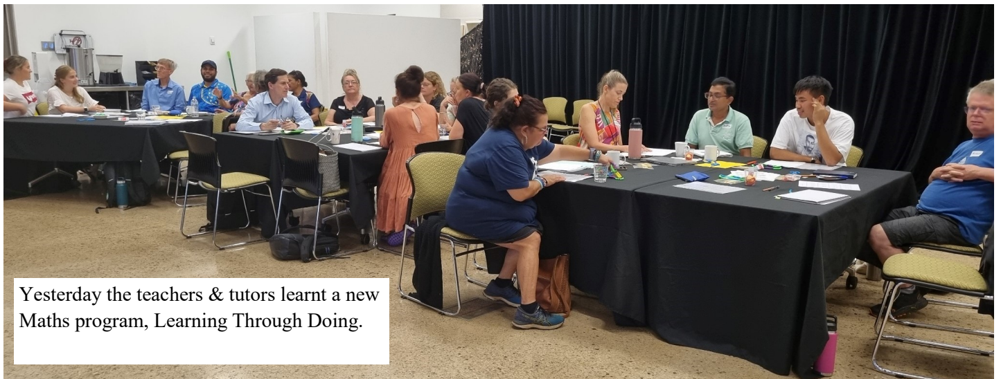
Yesterday the teachers & tutors learnt a new Maths program, Learning Through Doing.